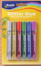
Bostik Glitter Glue