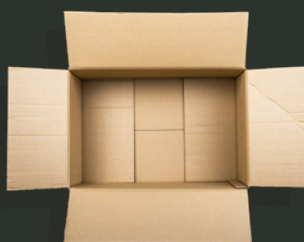
Long cardboard box (40cm x 20cm)