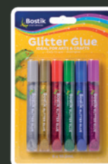
Bostik Glitter Glue