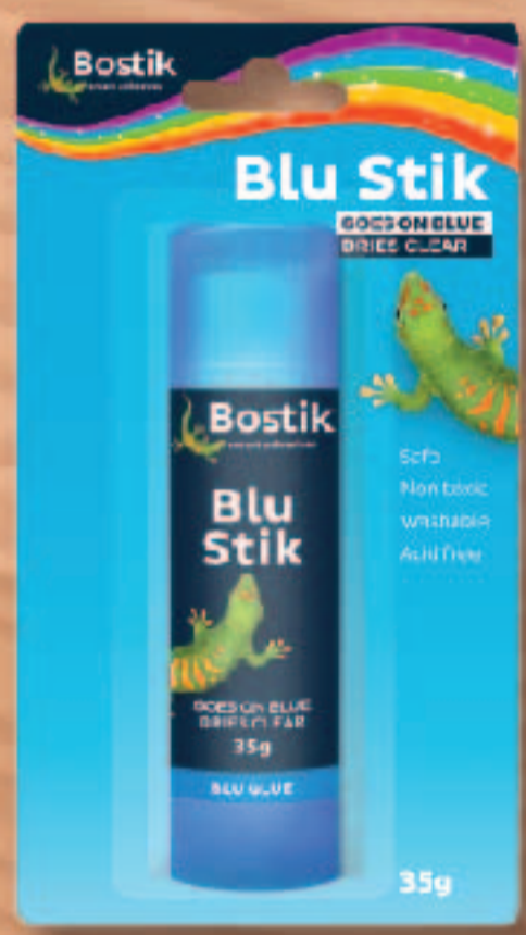
Bostik Blu Stik