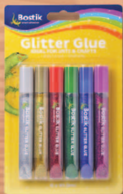
Bostik Glitter Glue