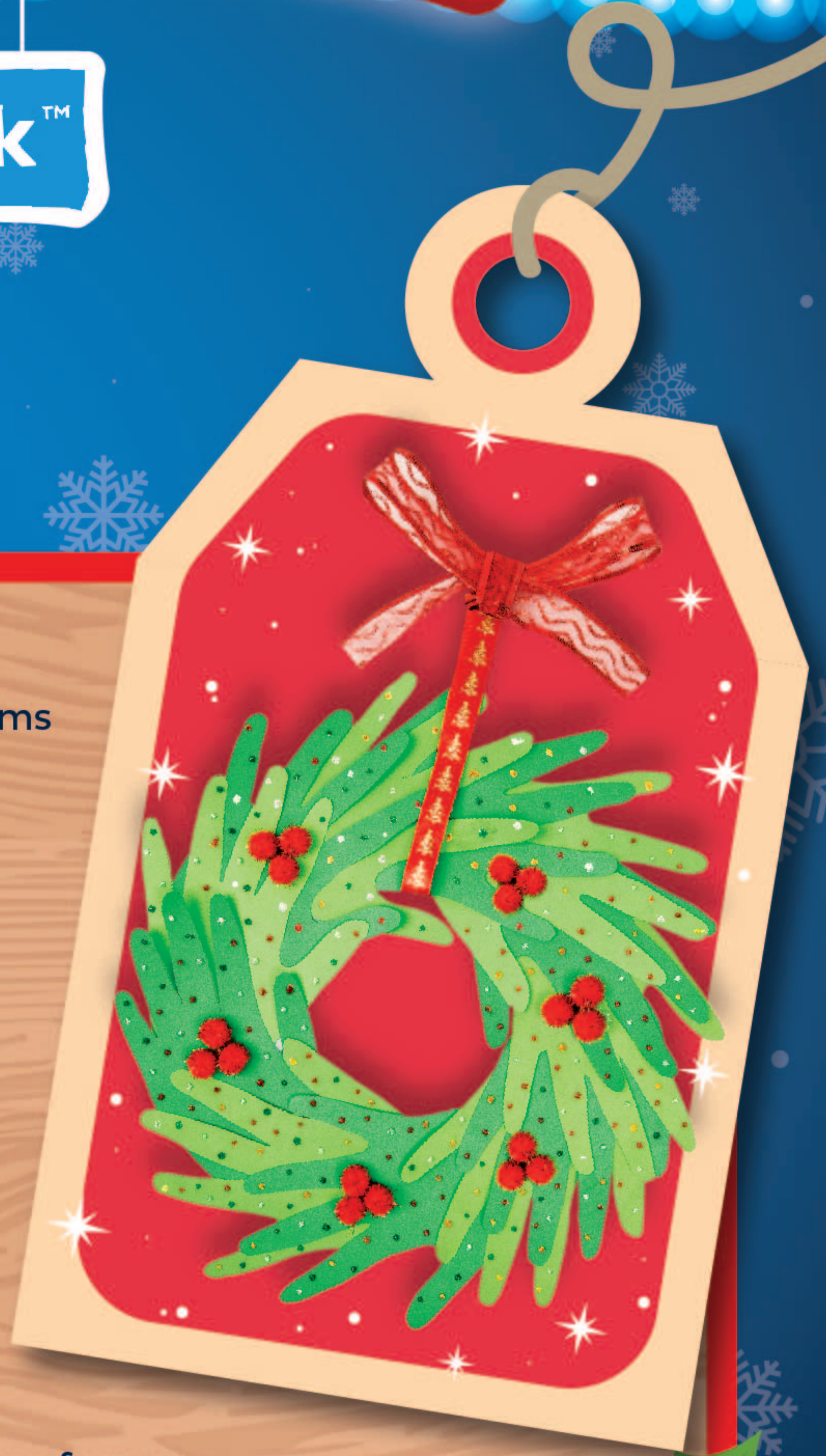
Two shades of green coloured paper