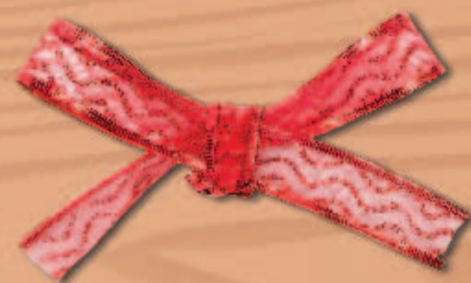
2 type of ribbons