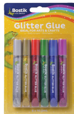
BOSTIK GLITTER GLUE