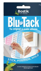
BOSTIK BLU TACK