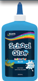
BOSTIK SCHOOL GLUE