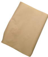
BROWN CONSTRUCTION PAPER