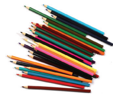
CRAYONS OR COLOURING PENCILS