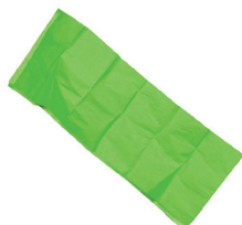
GREEN CREPE PAPER